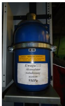
Hydraulic Accumulator for Emergency Fast Operations