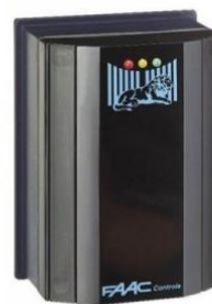
Proximity Card Reader