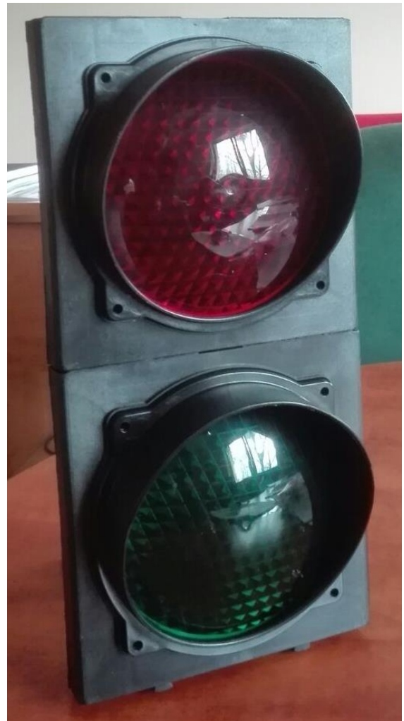
LED traffic light on integrated post